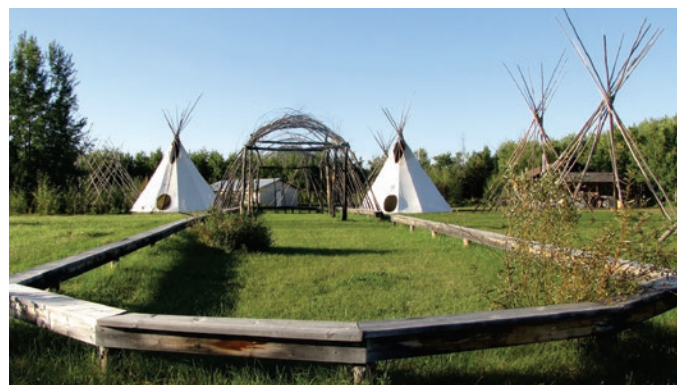
UnBQ Campus — Cultural Grounds